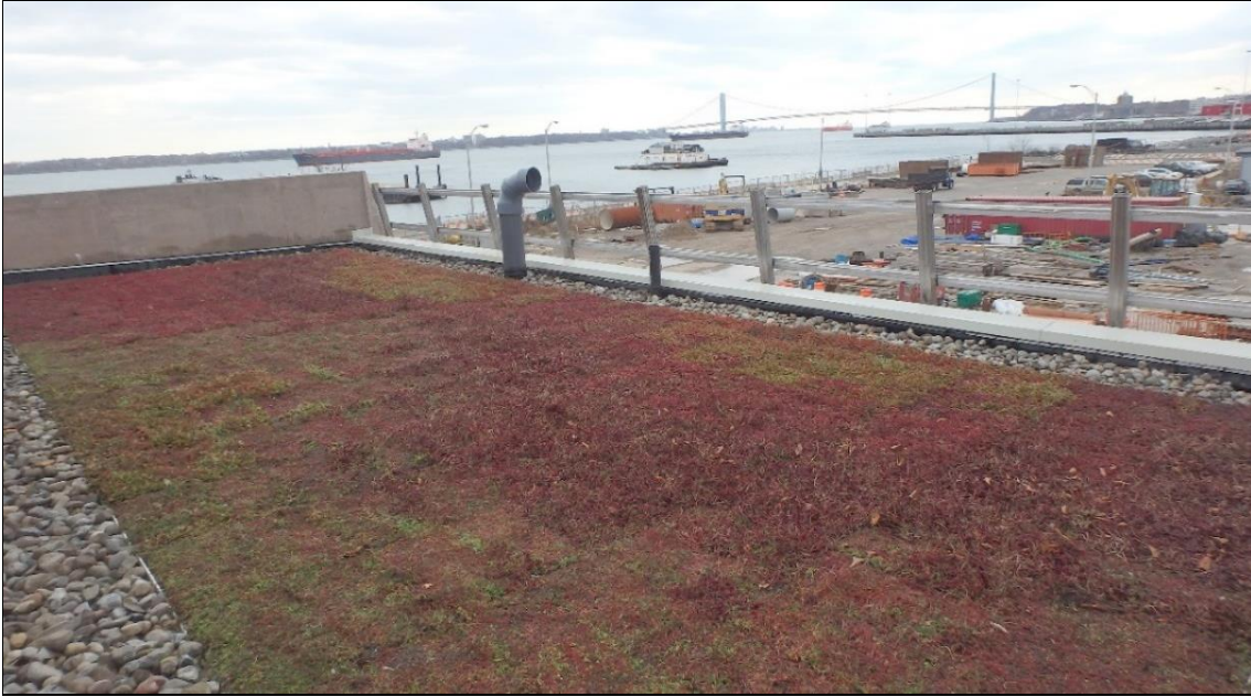
Newly installed Green Roof on top of Chlorination Station. Plants are a variety of Sedum, also known as Stonecrop.