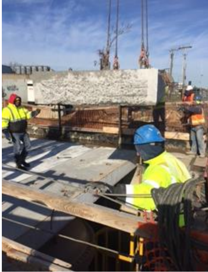
Installation of Precast Plank atop Staten Island Shaft