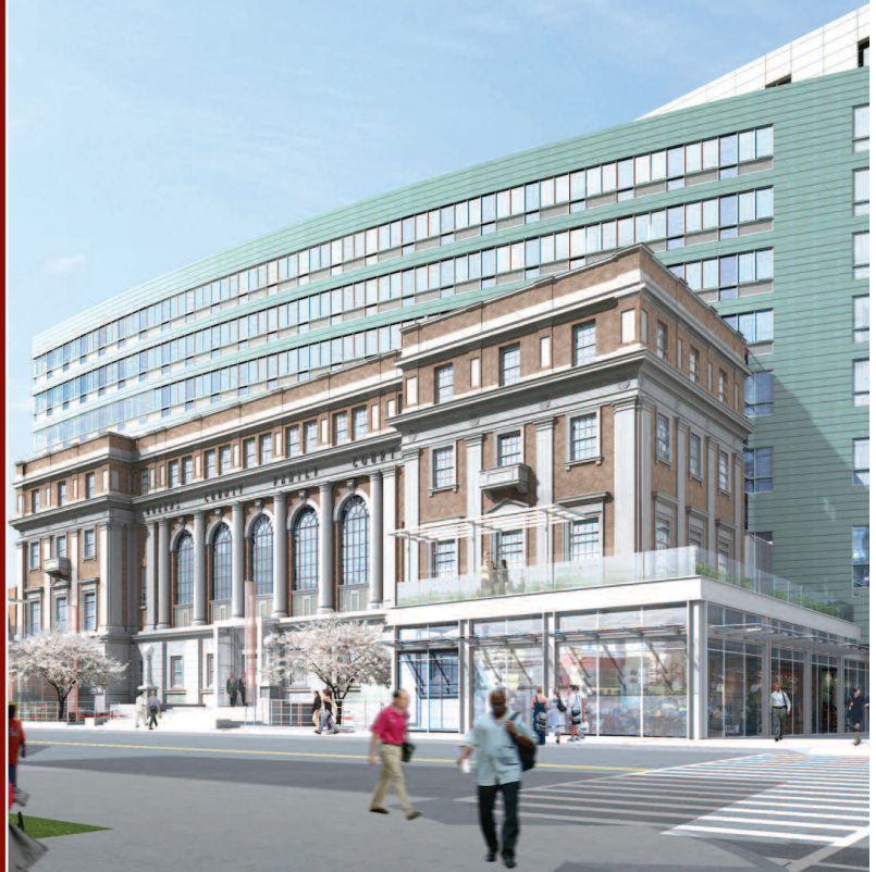
Dermot Company Rendering of the Queens Family Courthouse Redevelopment

This newsletter will provide you with a snapshot of progress to date, focusing on different topics in each quarter. This quarter focuses on schools, housing and jobs . The objective is to inform the public about upcoming City projects, as well as to give updates on City-sponsored events related to the rezoning.