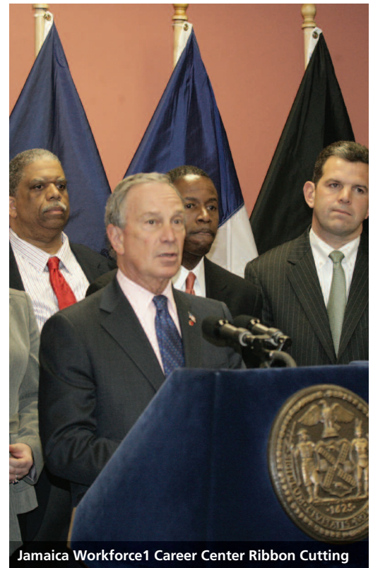
Jamaica Workforce1 Career Center Ribbon Cutting