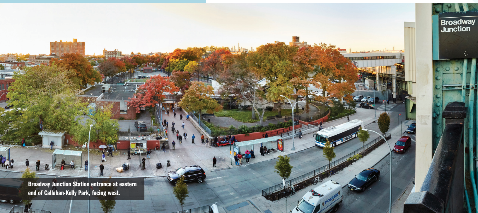
Broadway Junction Station entrance at eastern end of Callahan-Kelly Park, facing west.