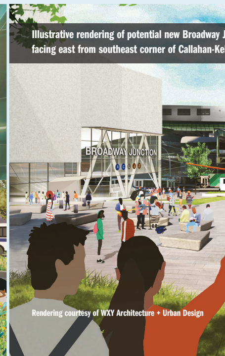
Illustrative rendering of potential new Broadway Junction, facing east from southeast corner of Callahan-Kelley.