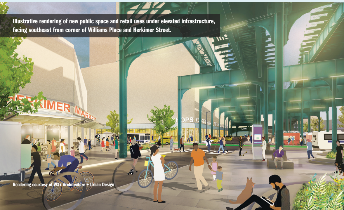
Illustrative rendering of new public space and retail uses under elevated infrastructure, facing southeast from corner of Williams Place and Herkimer Street.