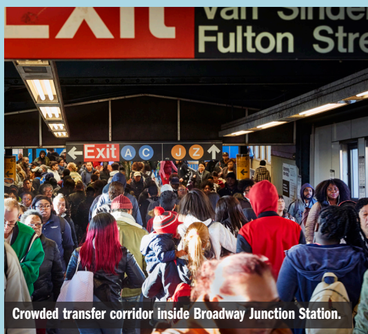
Crowded transfer corridor inside Broadway Junction Station.