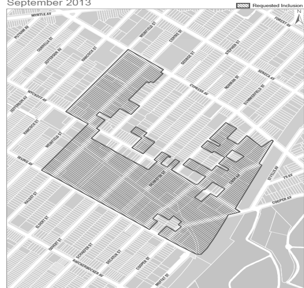
Prepared by New York City Economic Development Corporation (MGS Unit) 08/12/2013