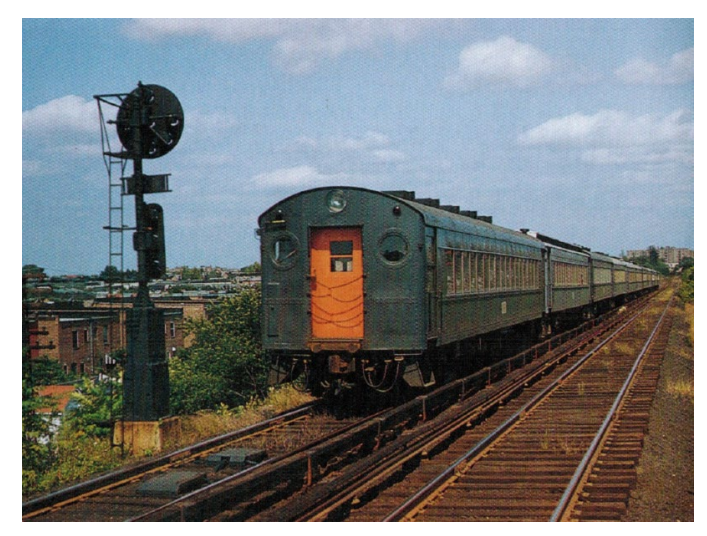
LIRR train at Metropolitan Ave. in 1955