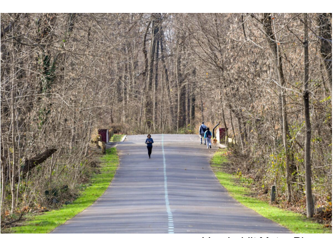
Vanderbilt Motor Pkway,