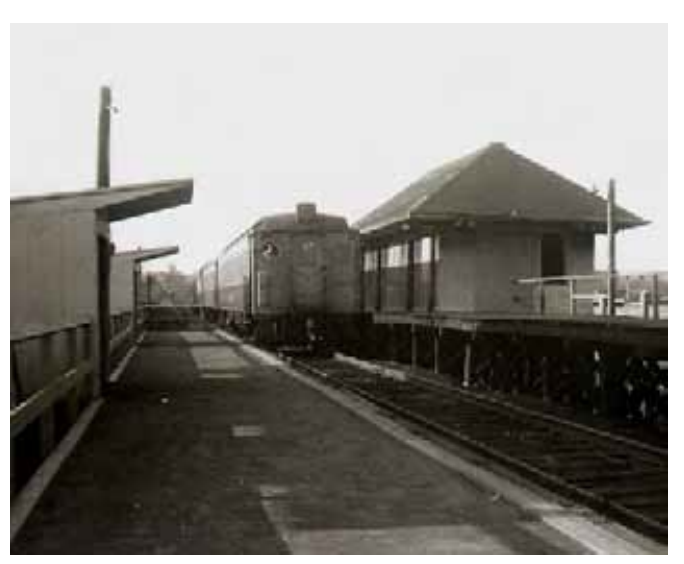
Long Island Rail Road Station at Metropolitan Avenue