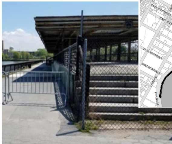
Existing Pier at 107 th St