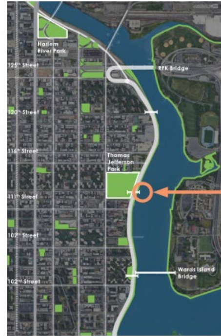
112 TH STREET