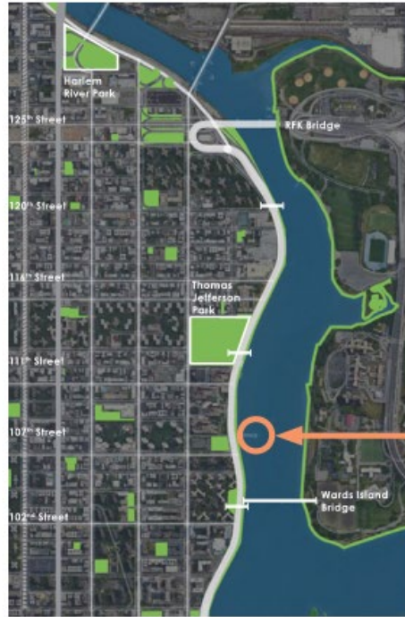
107 TH STREET EXISTING LOCATION