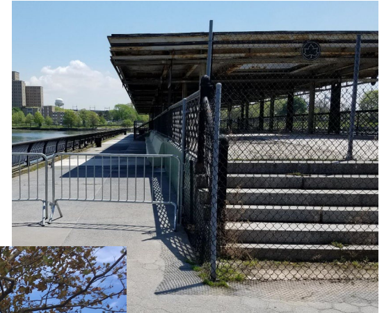
Existing Pier at 107 th St