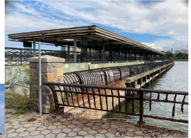
Existing Pier at 107 th St