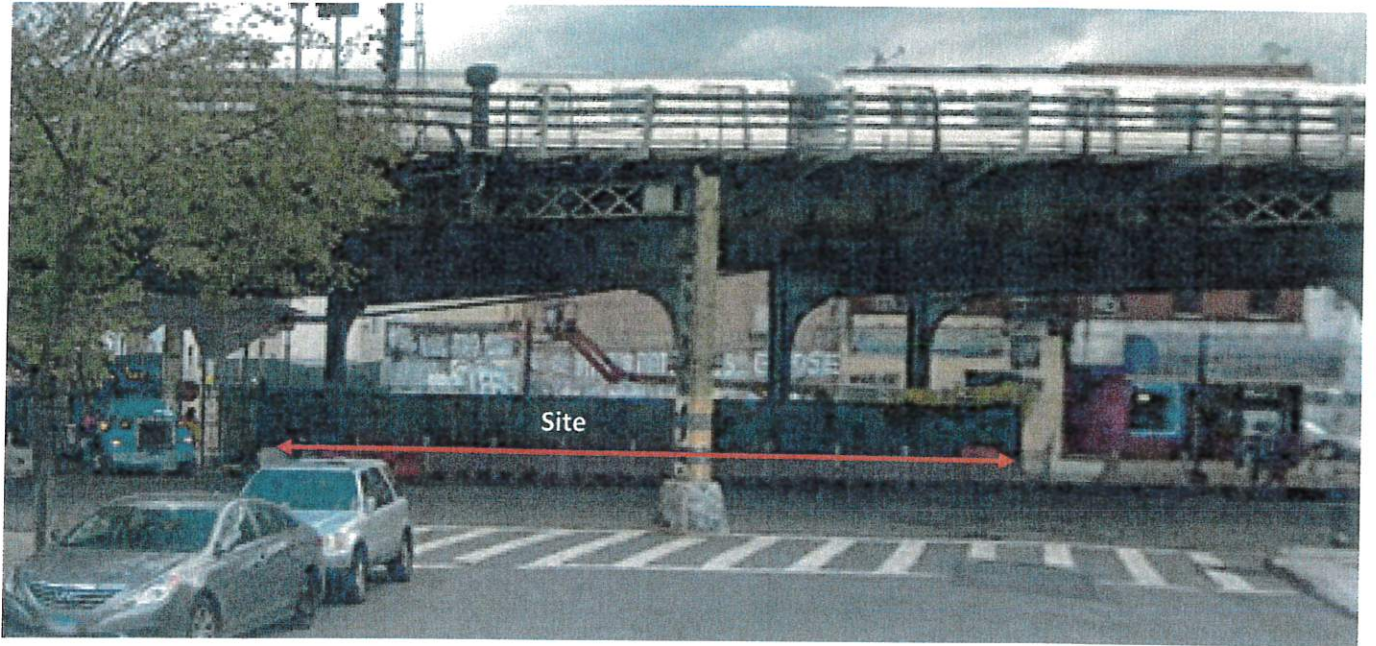
Street View of Site